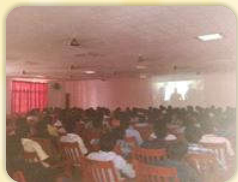
The students' interaction with the crew of a documentary film Mr.Nangai screened on 9 th March, 2018 by the Department of social.