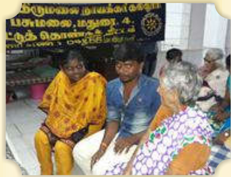
Our college NSS volunteers visited old age home to create a Social Awareness among our students on 06 th October, 2017.