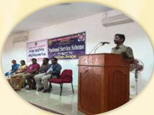
An awareness campaign on Eradication of Liquor was conducted on 27 th February, 2018.