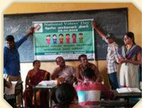
Our college NSS unit conducted National Voters Day competitions to the students on 23 rd January, 2018.