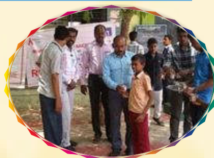
YRC and RRC jointly organized Dengue Awareness Programme and distributed Nillavembu Kasayam in Government Kallar Elementary School, High School students and general public, at Thanakankulam on 04 th August, 2017.