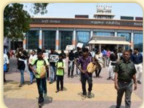
Social Work students enacted a street play on TB Awareness organized by RUSS Foundation & Madurai Rajaji Government Hospital in Madurai Railway Station on 23 rd March, 2018.