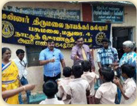
Our college NSS units conducted Dengue Awareness Programme in Government Higher Secondary School at Vadivelkarai on 21 st August, 2017.