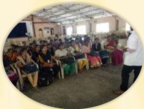
Medical counselling and health checkup for our PG women students and faculty by the medical practitioners of AVN Arogya Ayurvedic Hospital, Madurai, held on 14 th February, 2018.