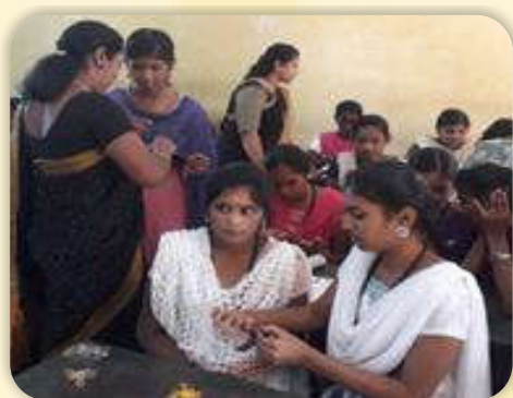
Training for our women students to make jewels, artificial bouquet and paper craft held between 02 nd February, 2018 and 14 th March, 2018.