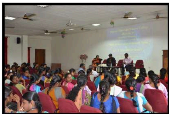
Interaction with Journalists from The Hindu.