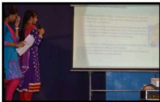
Paper Presentation by M.Com(CA) students at SRNM College, Sattur on 16 th Sep 2016.