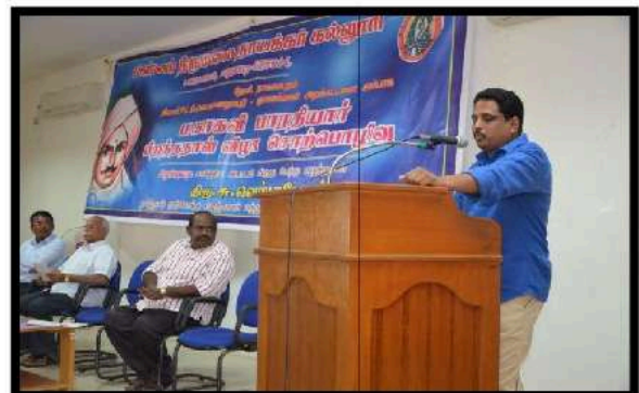
Bharathiya's Birth Anniversary was celebrated on 11 th Dec 2016.