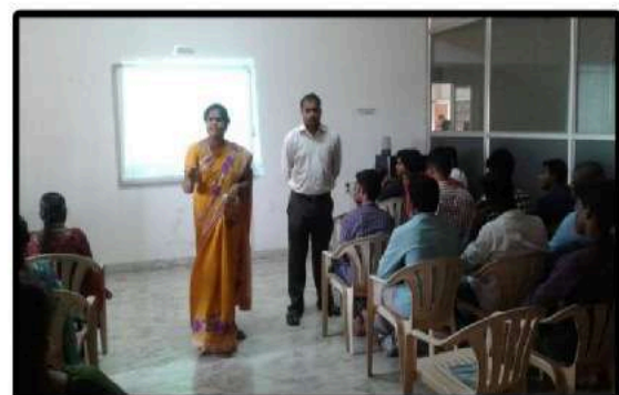
Awareness Programme on IIT Spoken Tutorial for the faculty on 30 th Dec 2016.