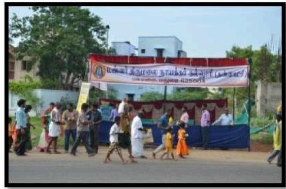
The college offers water and buttermilk to the devotees of Lord Muruga every year during the season of Visakam.