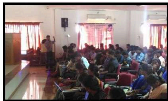
Department of IT in association with Robokart and Innovation Cell organized a National Level Seminar on Android Workshop Programme on 28 th Feb 2017.