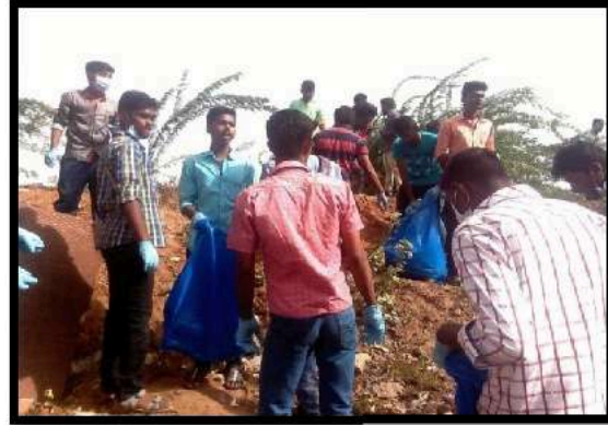
NSS Volunteers in Cleaning of Sellur Tank organized by Vaa Nanba Organisation on 7 th July 2016.