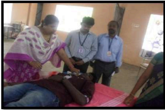
Students donated blood to Govt Rajaji Hospital, Madurai on 27 th Jan 2017. 280 pints donated in three phases throughout the year.