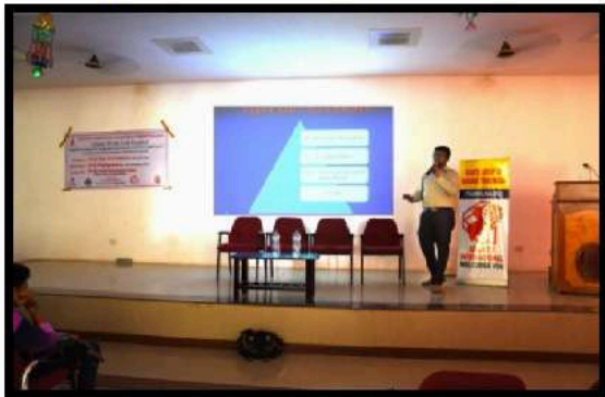
Emergency Medicine Awareness Programme for NSS volunteers organized by Giants Group of Madurai on 20 th Sep 2016.