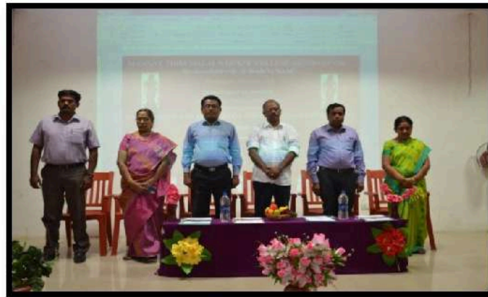
National Seminar (Autonomy Grant) on Nano Science and Technology for Energy and Environment on 17 th Feb 2017.