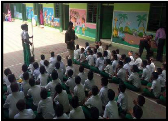
Awareness for Agriculture and Simple Scientific Methods by NSS volunteers in Meenakshi Matriculation School on 1 st Sep 2016.