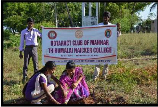
Rotaract Club members plant saplings in the campus