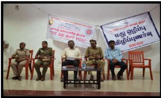
An awareness campaign on Eradication of Liquor.