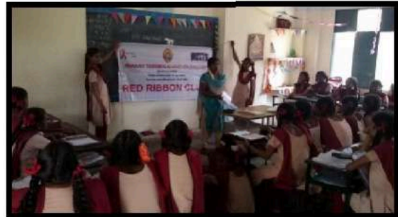
Members of Red Ribbon Club conducted an awareness programme on Eye Care and Donation on 10 th July 2016 at T.Ayyankottai Higher Secondary School, T.Ayyankottai, Madurai and issued 500 pamphlets stressing the need for eye care and eye donation.