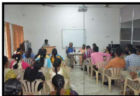
Synopsis Approval Committee meeting for M.Phil Scholars.