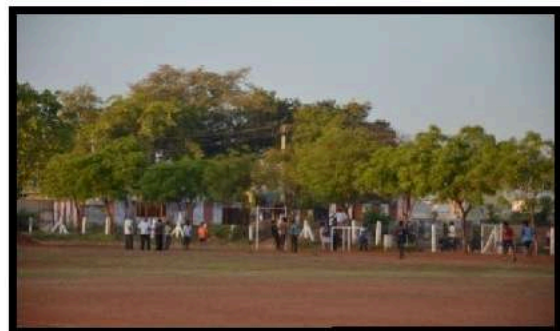
Public use our playground for their fitness