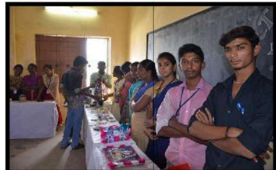
Art from E-Waste exhibition on National Science Day celebration by Department of Computer Science on 27 th Feb 2017.