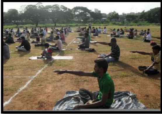
Our college students in the International Yoga Day organised by The Madura College on 20 th June 2016.