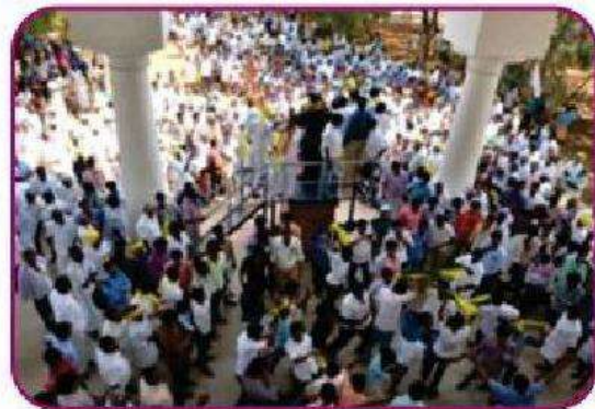
Vice President and Secretary are seen with the dignitaries.