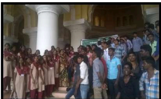
NSS volunteers in Swatch Bharath Cleaning Programme in Thirumalai Naicker Mahal on 15 th Dec 2016.