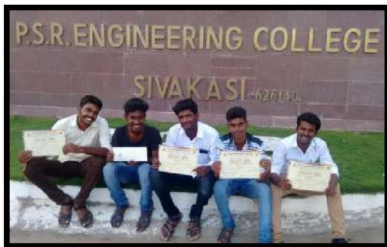
Overall Championship in the Intercollegiate Competitions conducted by PSR Engineering College, Sivakasi.