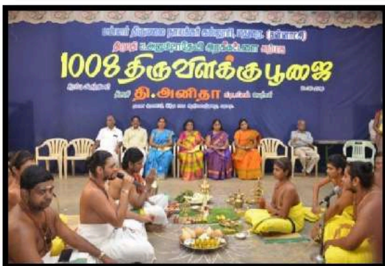
1008 Thiruvilakku Pooja is conducted every year in the Tamil month of Aadi for the promotion of world peace.