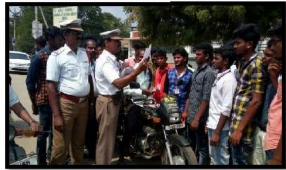
NSS volunteers in Road Safety Programme at Mulakkarai Bus Stop on 6 th Feb 2017 organised by the Traffic Police Department.