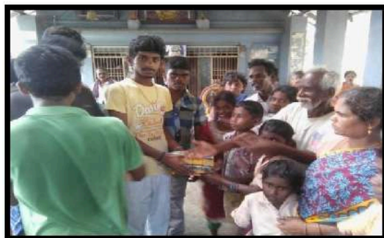
Students at Flood Relief Campaign in Cuddalore.