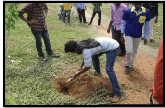
NSS Volunteers in Palm Seed Plantation Campaign at Thenkaal Tank on 27 th Dec 2016 organised by Wish To Help Charitable Trust