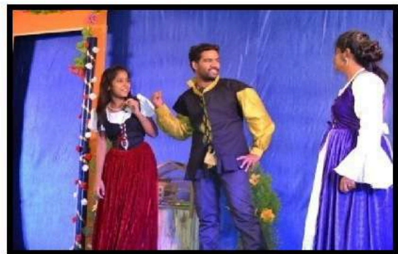
Department of English (SF) staged Shakespeare's play A Midsummer Night's Dream in Sep 2016.