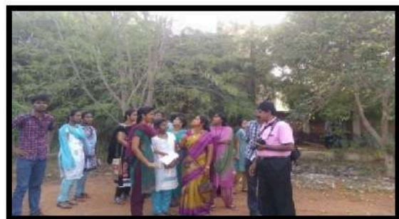
Students counted birds in the campus and identified more than 23 Species of Birds in the college campus.