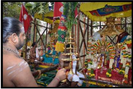
Deities Meenakshi and Sundareswarar are in the campus enroute to Thiruparankundram temple.