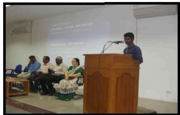
Guest Lecture on Chartered Accountant Career Awareness by Department of Commerce on 21 st July 2016.