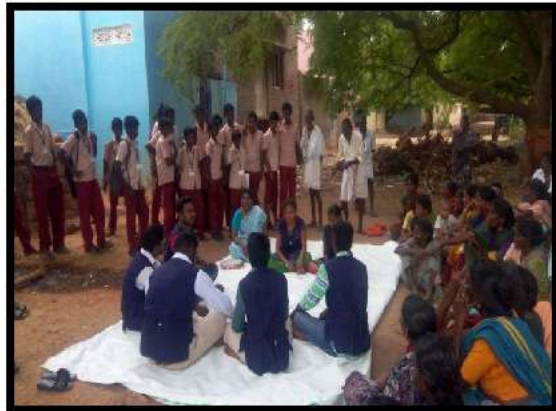
Awareness Campaign on Child Labour and Child Marriage by NSS volunteers in American College School, Tallakulam on 1 st Sep 2016.