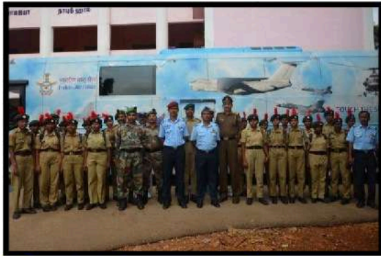
Airforce Awareness Programme conducted by Airforce Authority of India