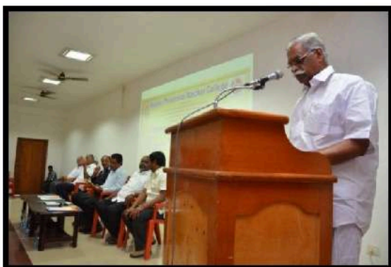
Vice President's Felicitation