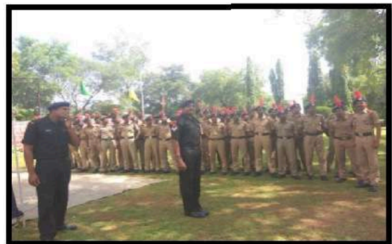
Valedictory Programme of Army Attachment Camp