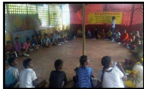
Our Students at Sensitization Programme on Child Labour and Child Marriage at Vidiyal, Madurai.