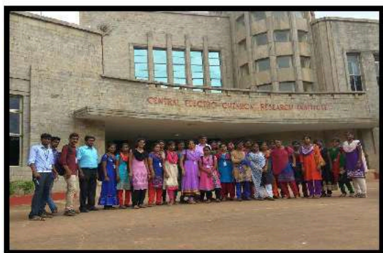
Educational Visit to Central Electrochemical Research Institute (CECRI), Karaikudi by final year students of Physics on 27 th Sep 2016.